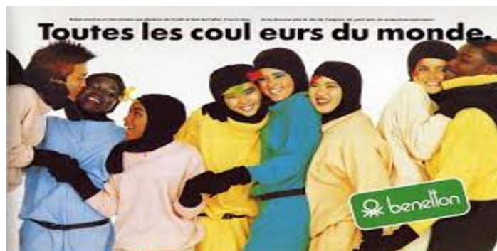
Figure 2: United Colors of Benetton campaign bets on the plurality of skin colors of models and equally colored clothing © Benetton – 1985