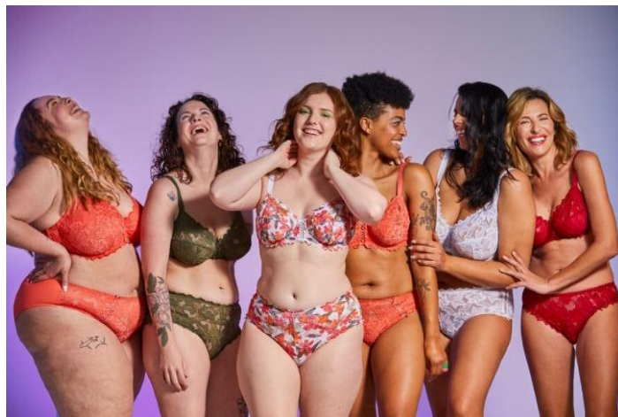
Figure 4: advertising campaign for the lingerie brand “Sans Complexe”, launched on March 8, 2022

One of the reasons fashion photography may not provide explicit explanations is to allow viewers to interact with the images on a personal level. leaving room for interpretation. The photographs encourage individuals to bring their own experiences, perspectives and emotions into the story. This ambiguity can spark conversations, spark curiosity, and challenge conventional notions of beauty and style. Engaged fashion photography creates an image that has a story and contains a message for the consumer; this message comes from the components of the image, the mood, the poses of the models and accessoires, and every change on these things makes a difference in the meaning and the message. Because fashion photography is a science that has principles and standards related to the history and identity of the brand, so it's not just photography. Also it can often convey a sense of mystery and depth, leaving room for interpretation and personal reflection. The enigmatic nature of these images can capture the imagination and bring a wide range of emotions and thoughts. While some may find it interesting, others may be disappointed by the lack of explicit explanations or clear meanings. It is important to remember that art, including fashion photography, can be subjective and different interpretations and reactions are valid.