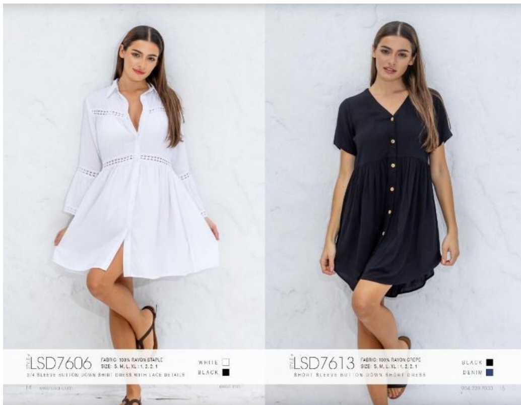
Figure 5: EXIST Brand Fashion Catalog, P 14 – 15, 2023

Fashion catalog : Fashion catalog is a means of print or digital publications that feature a brand's collection of clothing, accessories, and other fashion items. It is a marketing tool to present the latest creations and encourage consumers to make purchases. Catalogs are usually designed to be visually appealing, with high-quality photos or illustrations of models wearing the clothes or showcasing the products in a captivating way. The catalog includes photos with a special theme and message, as shown in Figure 5 which shows a catalog for the "EXIST" brand.